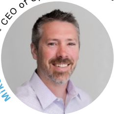
Mike Shehan - CEO of SpotX

On 2 November 2015, SpotX and ad-tech start-up Clypd announced the development of a single solution for media owners to manage the sale of all forms of TV assets and video inventory. The pairing of SpotX's digital video platform and Clypd's linear TV platform will create ad sales solutions that empower media companies to holistically monetise audiences and video across all distribution points. SpotX and Clypd are part of the RTL Digital Hub which was launched in June 2015 to bundle RTL Group's recent investments in the online video market.